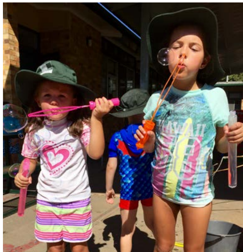
K-2 Water play