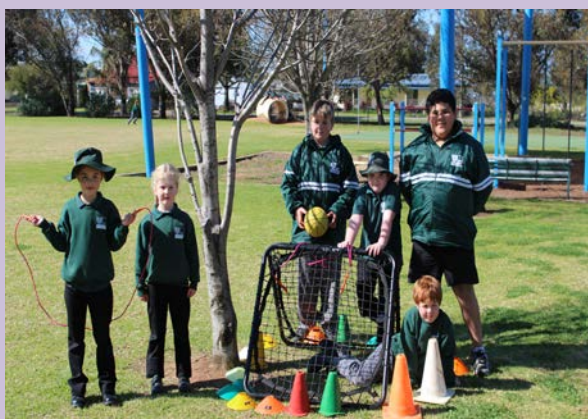
Lunch time fun