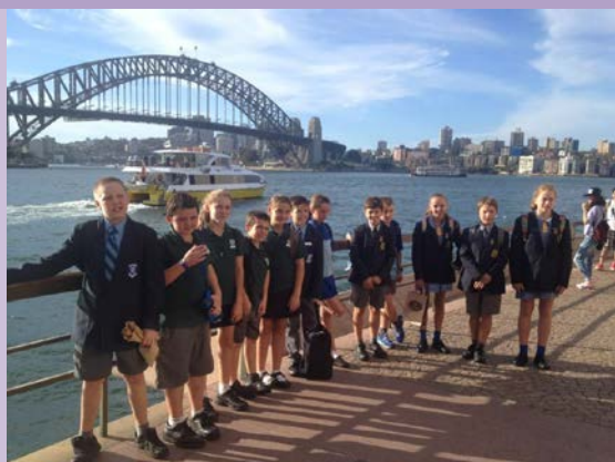
2015 Young Leaders