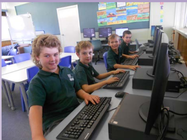
3-6 Students utilising the technology.