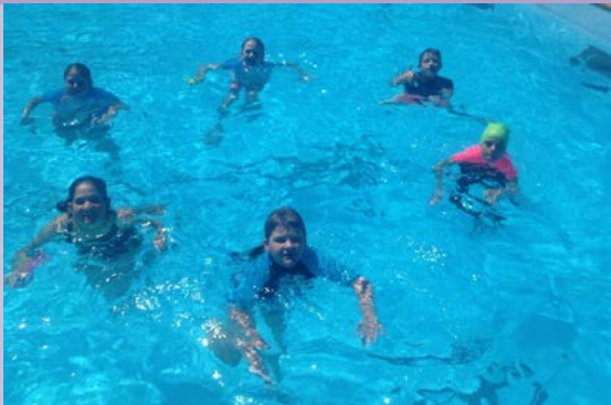
Student's participating in the School Swimming Scheme.