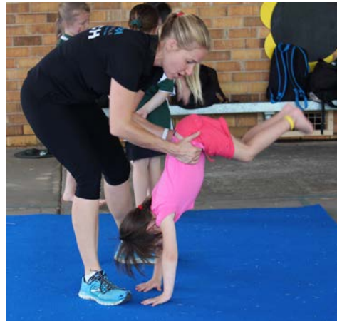
India practising gymnastics