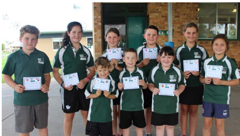
Friday's award ceremony recipients