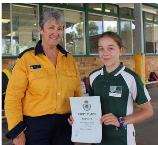
First prize in the Colouring comp'