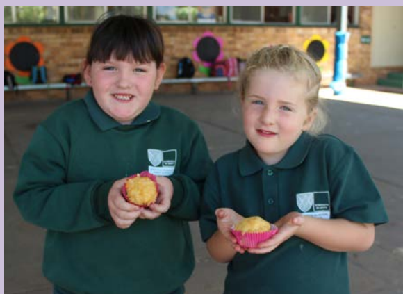
SAVOURY MUFFINS FROM COOKING CLASS