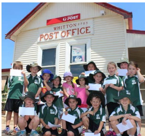
Infant students mailing letters to Santa